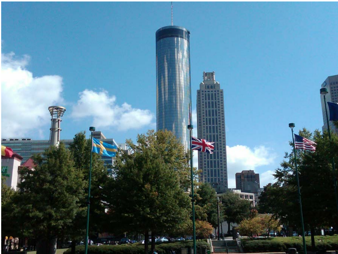
Part of the Atlanta Skyline near the Conference Center